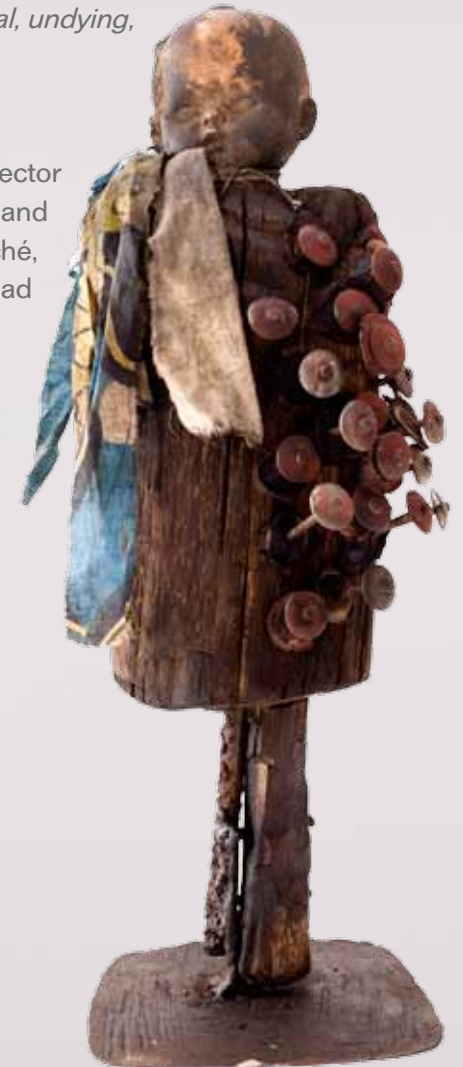
Bocio, 2008. Mixed media, 47 x 18cm. Private Collection.