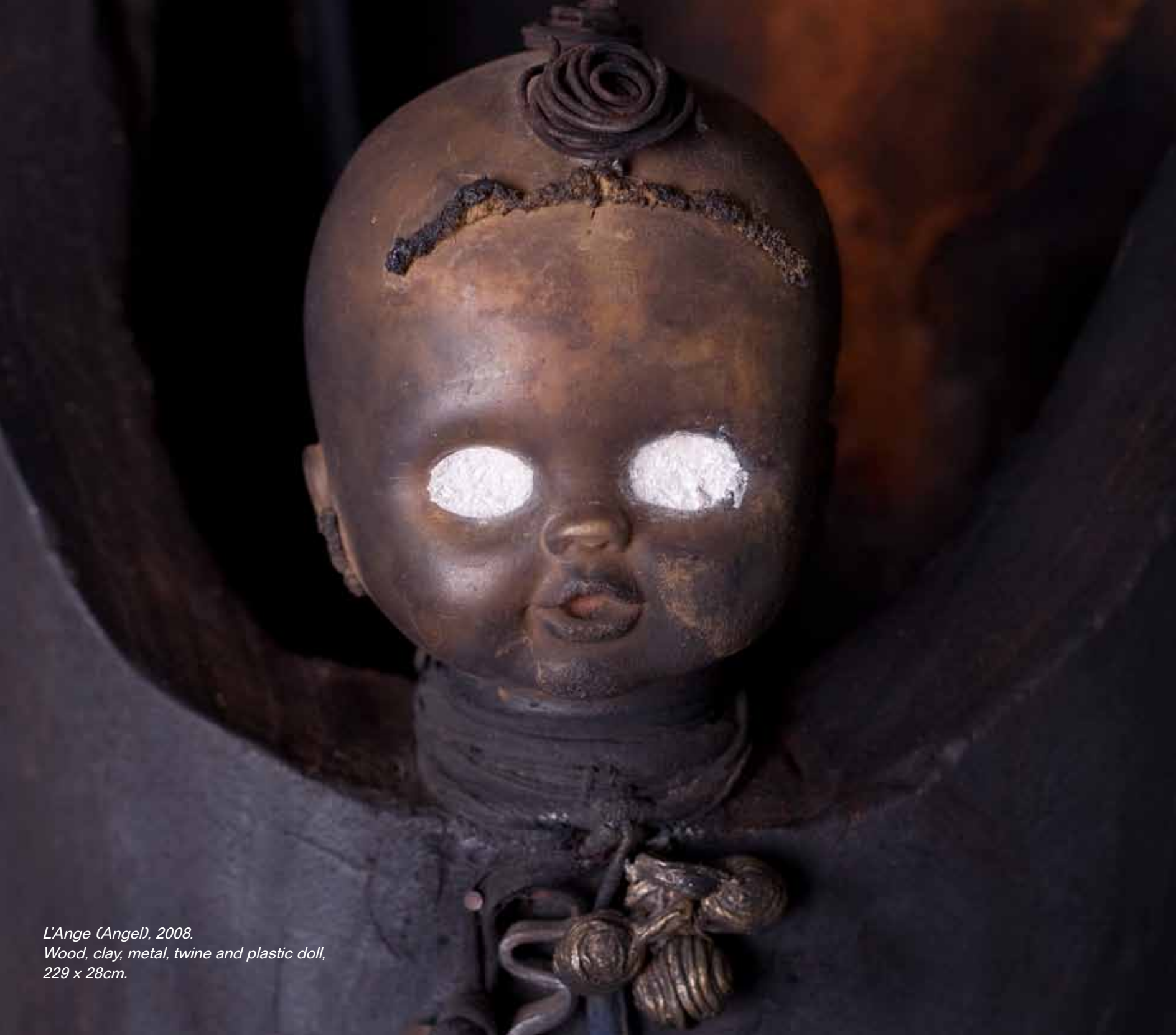
L'Ange (Angel), 2008. Wood, clay, metal, twine and plastic doll, 229 x 28cm.